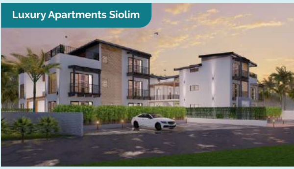
Luxury Apartments Siolim