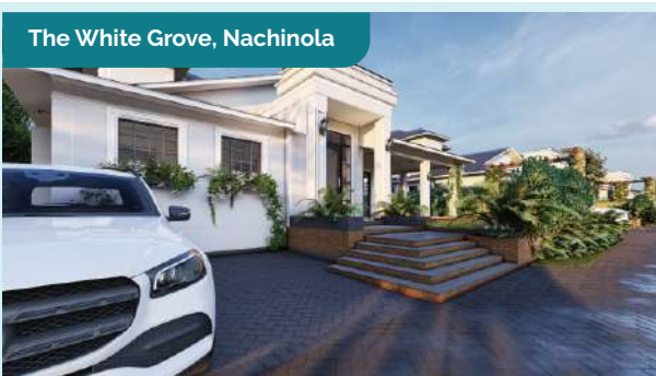
The White Grove, Nachinola