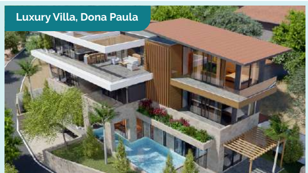
Luxury Villa, Dona Paula