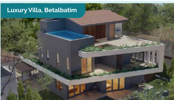
Luxury Villa, Betalbatim