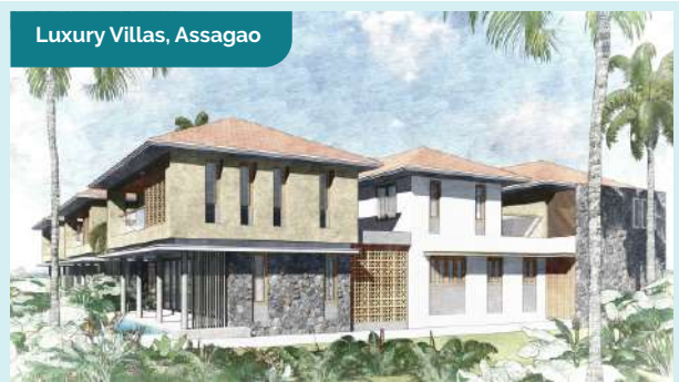
Luxury Villas, Assagao